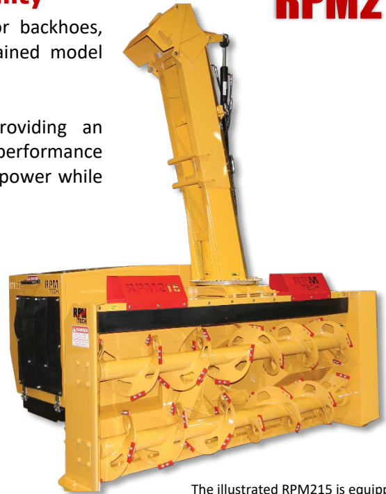
The illustrated RPM215 is equipped with bolted ice breakers on augers