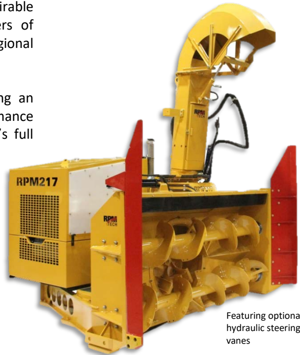
Featuring optional hydraulic steering vanes