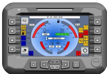
Optional color screen