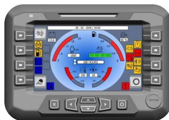
Optional color screen